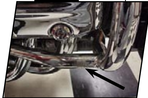
PLACE MOUNTS HERE ON VALKYRIE MODELS