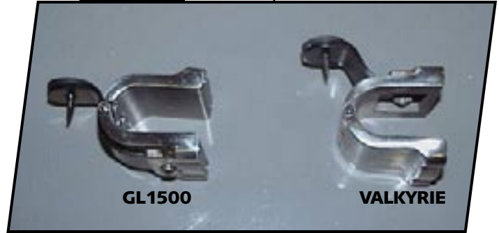
HINGED CLAMP/LEVELING BRACE ORIENTATION