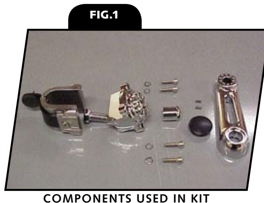
COMPONENTS USED IN KIT