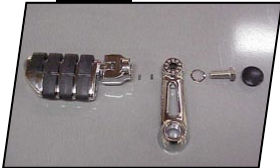
COMPONENTS AND ORDER OF ASSEMBLY